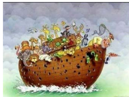
The woodpecker might have to go.